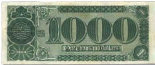
1890 $1,000 "GRAND WATERMELON" CURRENCY NOTE Sold for $2,100,000 Private Treaty

Our specialists have access to an elite group of collectors and their “want lists.” Of course, individualized attention, top expertise, thorough knowledge of your piece, and client confidentiality are priorities in all private treaty negotiations.