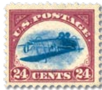
U.S. "INVERTED JENNY" ERROR STAMP Sold for $825,000 Private Treaty