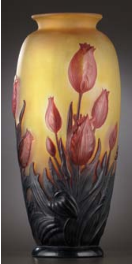
A FRENCH ART GLASS VASE Émile Gallé, Nancy, France Sold for $22,705

AUCTION, APPRAISAL & PRIVATE TREATY SERVICES