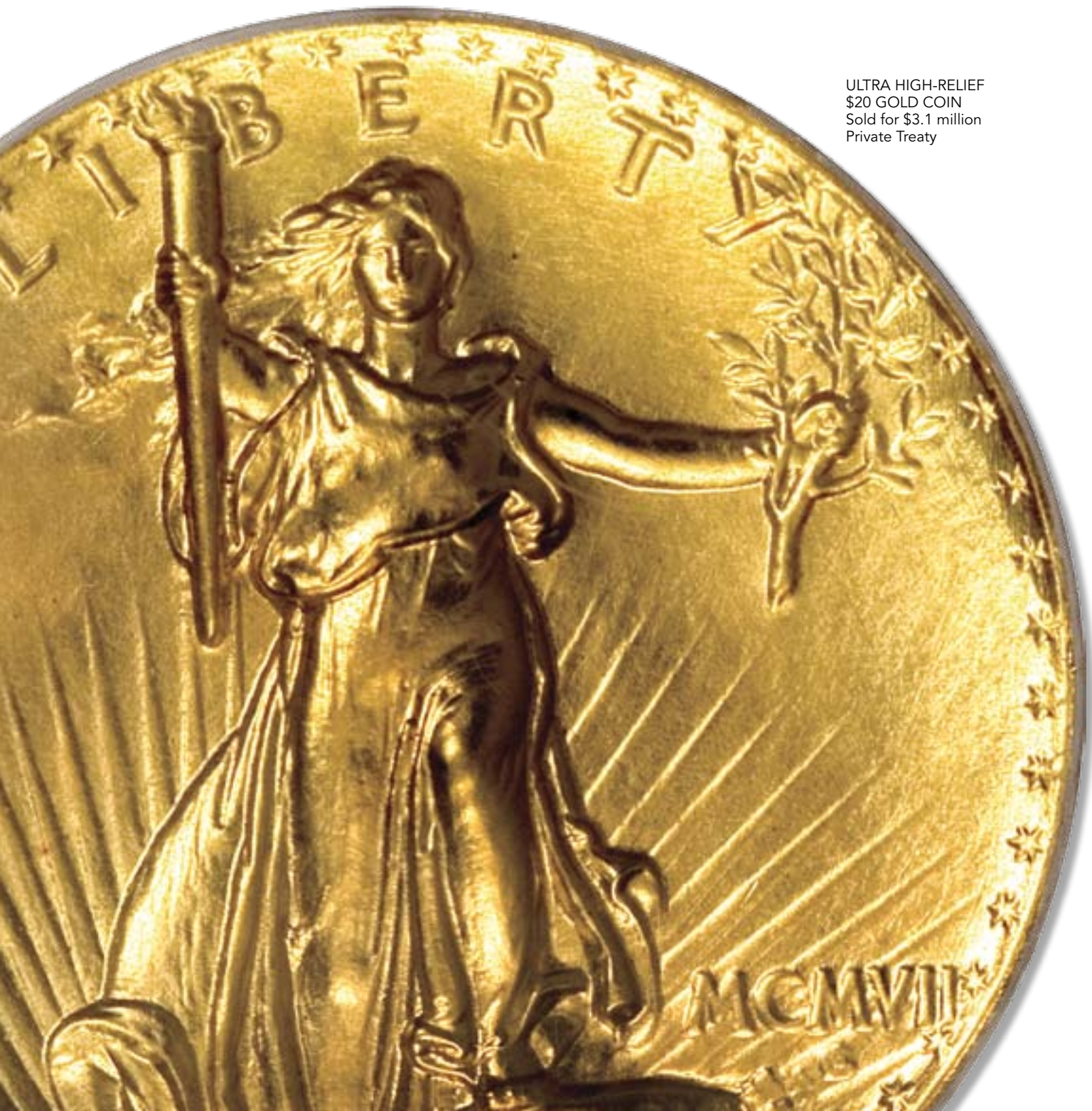
ULTRA HIGH-RELIEF $20 GOLD COIN Sold for $3.1 million Private Treaty