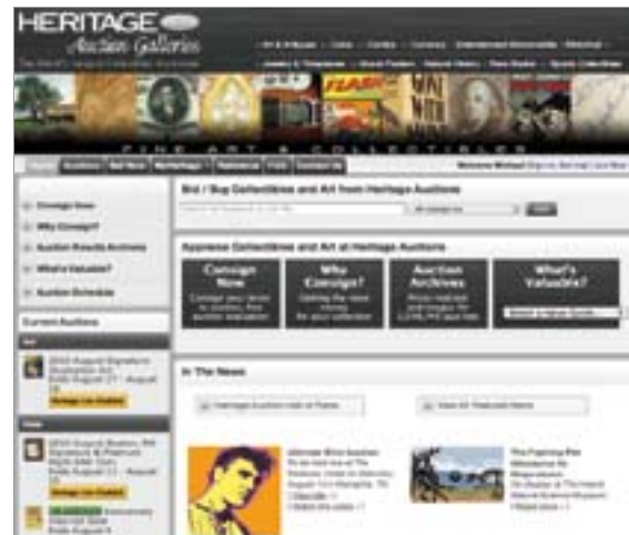
HA.com home page

Y ou don't want to miss this site! It's amazing! — The New York Times' About.com